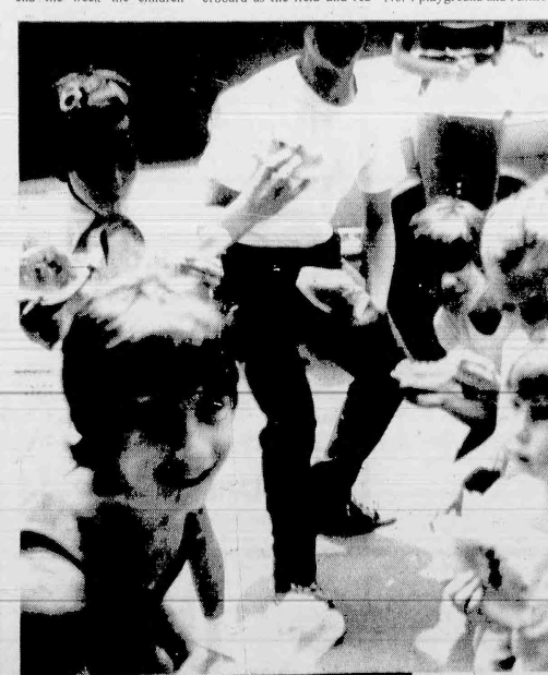
WATERMELON is offered at the No. 3 Playground in the Belleville Recreation Department and (l-r) these local youngsters are taking full advantage of the situation at hand.

The children at Fairway playground mixed ivory snow and water and molded figures from the mixture. Wayne