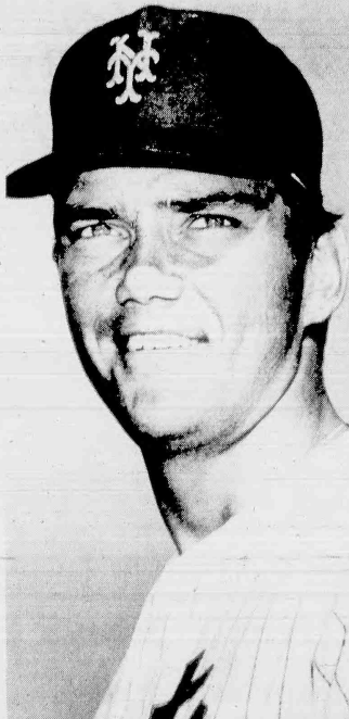
DUFFY DYER, hard-hitting catcher of the N.Y. Mets, will be a special guest at the DeWitt Savings and Loan 30th anniversary party this Monday. Dyer will be on hand to sign autographs for the kids.